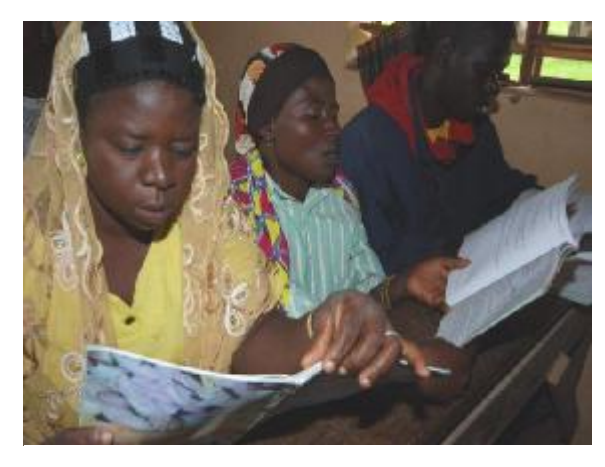
Education is key for improving the position of women.

Girls' school attendance is increasing even if it still lags behind the boys'. Statistics show that in 2007 already 92 percent of all 6 to 11-year old girls start school. For the boys the rate amounts to 98 percent. However, many of the girls give up again soon afterwards. Only 56 percent finish five years of primary school. The proportion of girls is decreasing even more when it comes to secondary schooling. The breeding ground for the girls' dropout rates are namely an uncertain economic environment, where they are asked to provide additional income. Furthermore early marriages favour school dropouts.