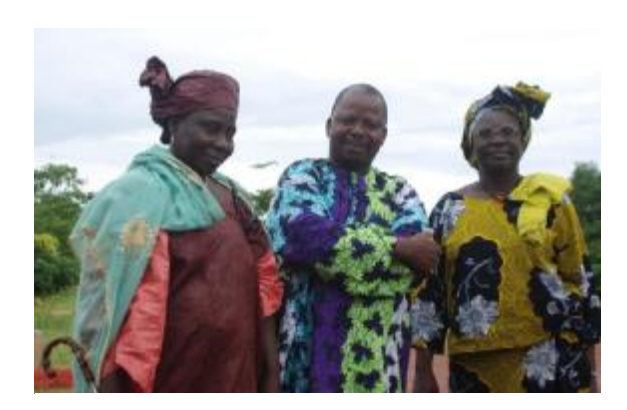
FAABA president with the elected and not elected municipal council candidates of N'Dali.

role is no coincidence, as gender equality has been a focus of Swiss development cooperation for a long time and has an effect on all programme areas, including budget support.