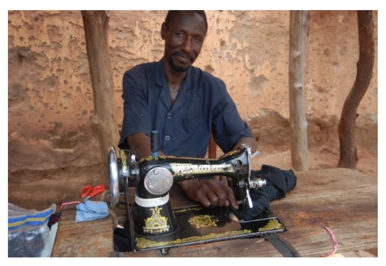
The road to equal opportunities for women and men is still long.