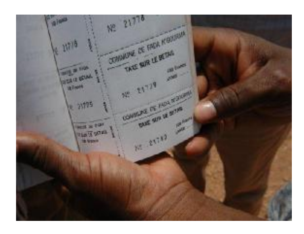
Cattle ownership is one source of income for the communities: 20 cents (100 CFA) per head and year.

The communities have received the competence to collect their own fees, for example for market booths or taxes for real estate or entertainment. This way, Fada N'Gourma has collected own resources of some 400'000 US dollars in 2007. Taxes are not popular. But they stimulate the insight that services from the community can only be expected if oneself is contributing. The gain is determined by the rules' enforcement as well as the local economic dynamic. In addition to their own revenue the communities receive subsidies from the state. "Contributions to our recurring costs