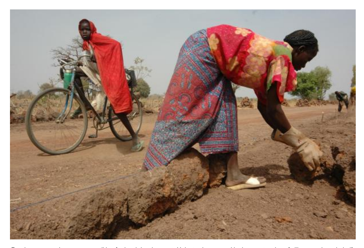
Rural access roads are a precondition for local development. Helvetas is engaged in the construction of village roads on behalf of the Swiss government.