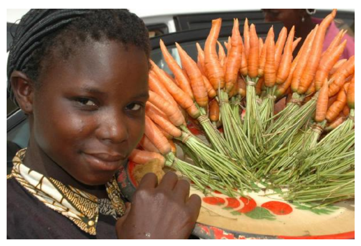
Cultivating and selling one's own vegetables strengthens the local economy.

Own revenues and financial transfers are not enough. The law foresees a permanent