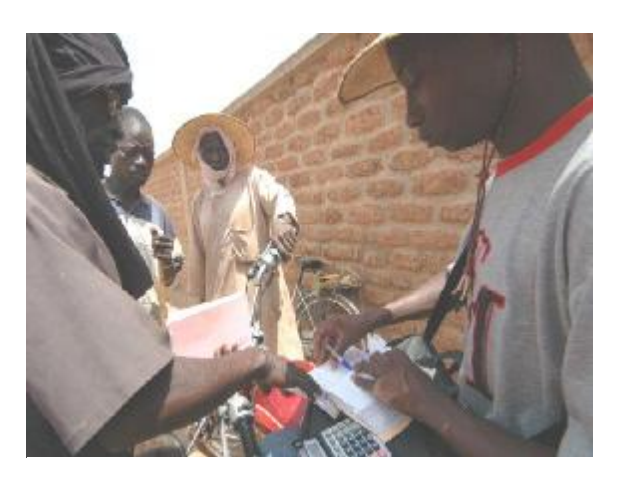
When selling cattle the fees are collected and signed for on the spot in the market.

For a francophone and therefore centralistic country such as Burkina Faso the way to more autonomy for communities resembles a small revolution. It is said that a former minister once called decentralisation "suicide for the central government". Few talk about political resistance, but there is "fear of the new and unknown", as Leonard Guira, director general of the ministry of interior says. "The mayors will get the fridges in the health centres and give them to their wives!" was only one of the many apprehensions. But the political will supporting decentralisation has once more been confirmed by prime minister Teritus Zongo in June 2008, when he presented a plan of action for the next year's implementation at a national conference.