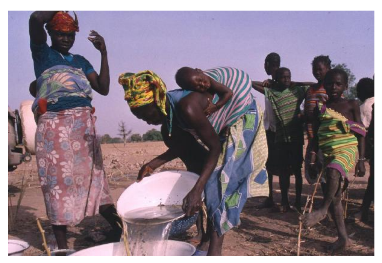
Even poor people who dispose of less than 50 cents per day are paying 15 percent of all duties and taxes.

The share of development assistance which is at the free disposal of the state for the co-financing of its core tasks ("budget