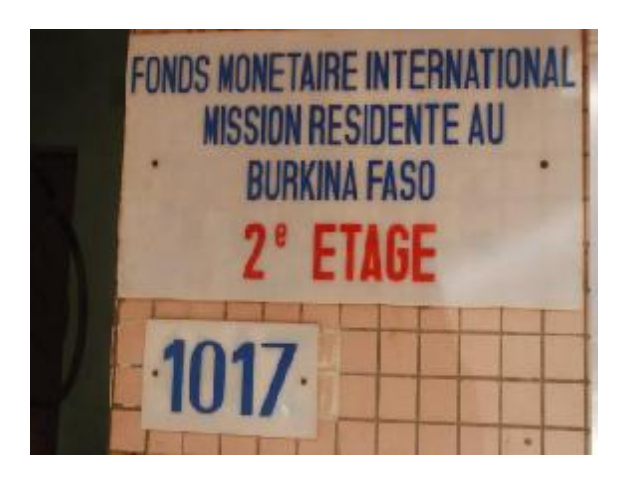
The International Monetary Fund plays a key role when it comes to reforming public finances.

lation fall below this line. But they provide 15 percent of all fiscal income. The rural areas with a high degree of self sufficiency are only weakly connected to the monetised economy. "Only little is produced for the market, there is no noteworthy monetary income and hardly anyone buys consumer goods. Which is why there is only little to tax", says Abdoulaye Zonon. The result that poorer regions and groups of the population carry a substantial tax burden was all the more a surprise.