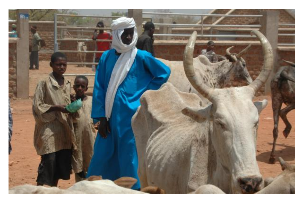
Cattle markets such as the one in Fada N'Gourma shown here, are generating income for communities. Switzerland specifically supported the construction of this cattle market.