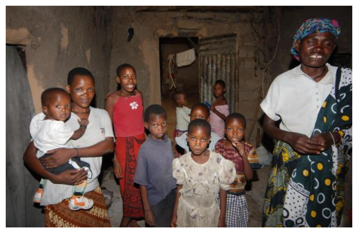
When it comes to all their doings, the government is accountable to its population.

For Switzerland it is important to motivate Tanzanian citizens to exercise their rights. It is not a coincidence that Switzerland held the co-chair in the Accountable Governance Cluster Working Group for several vears. Together with other donors Switzerland supports civil society actors in their efforts to demand accountability from the government through a variety of channels. On one hand it finances a media fund which notably wants to promote independent investigative journalism (see separate article). On the other hand it augmented a fund for civil society which in turn provides hundreds of specific contributions. In addition, Switzerland actively provides targeted