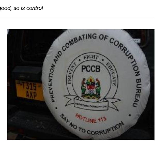
"Say no to corruption!" demands the anti-corruption agency.

Because the budget cannot be changed by parliament, effective influence has to be exerted at an early stage of its elaboration. Civil society organisations are therefore increasingly active in budgetary questions at the level of parliament. NGOs are analysing the government's budget and are lobbying for specific concerns. NGOs have not only written a popular explanation of the budget and the budget process, but also offered further education to interested parliamentarians including the question of how